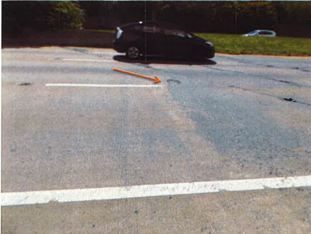
Pic # 45 Breakout at Abut. #1