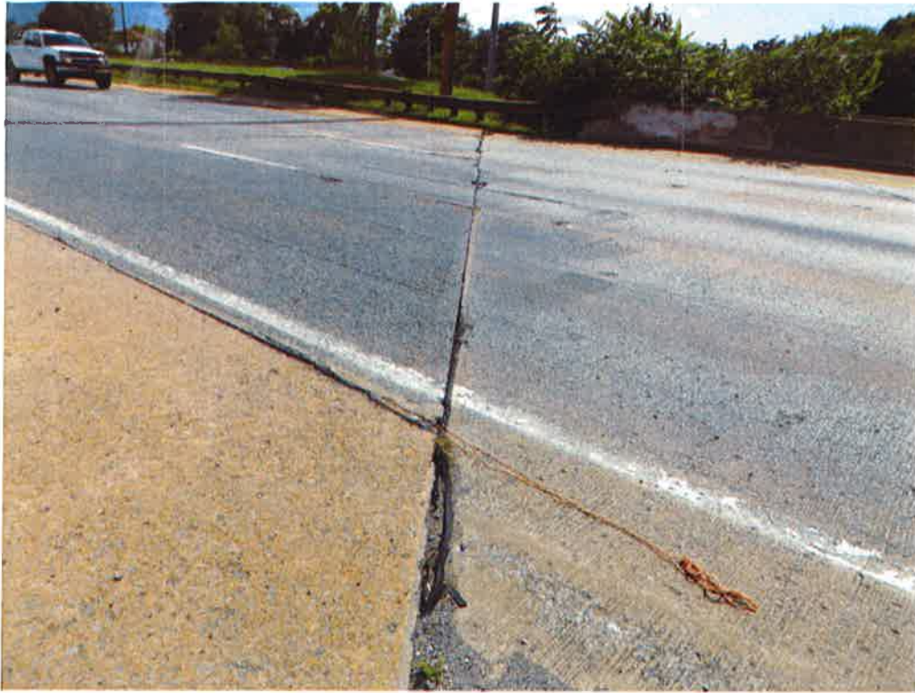
Pic # 43 Approach 2 Joint