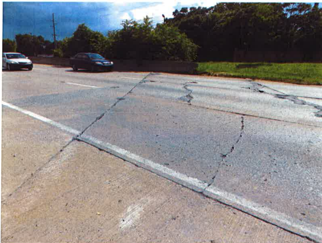
Pic #44 Approach 1; Bridge # 19-I440-072 L