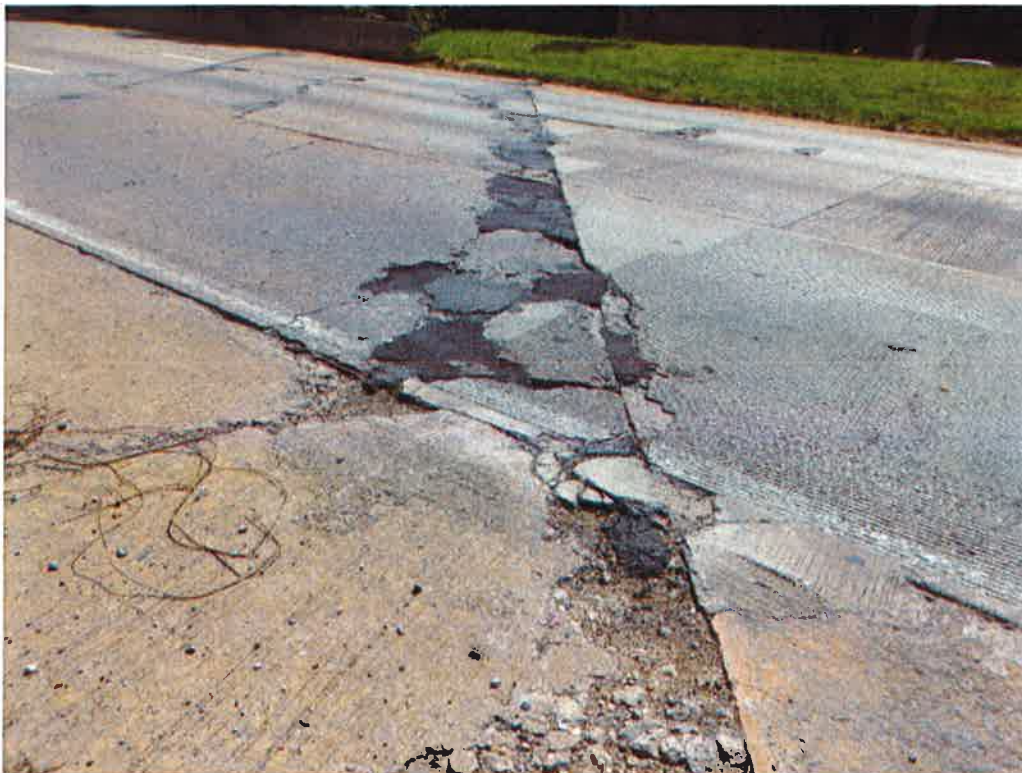
Pic #46 Breakout along Approach 1 Joint; Bridge # 19-I440-0.72 L /CSX